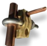
Brass «U» bolt clamp